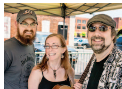
Fire in the Glen