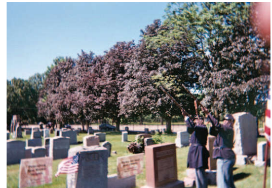
Gun salute at Midlands Cemetery