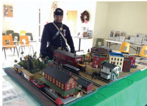
The 23rd USCT Exhibit at Strawberry Square.